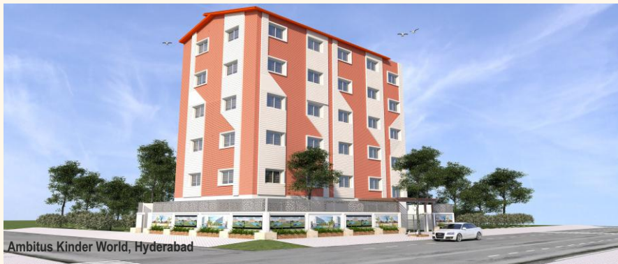
Ambitus Kinder World, Hyderabad