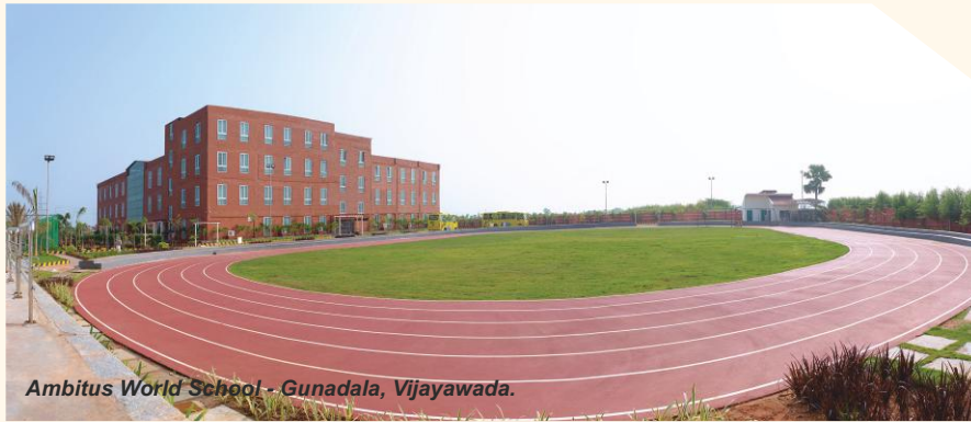
Ambitus World School - Gunadala, Vijayawada.