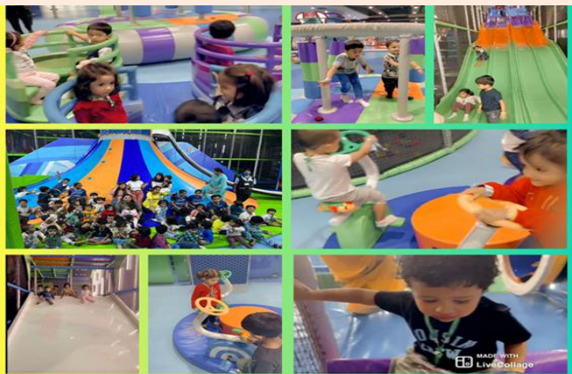
- Haasini Akkineni, Grade 9 AWS VJA

Colors have always been the epicenter of our whole existence and exposing the learners to the various sides of different color, seems not only amazing but a different learning experience for both the teacher and the learner. Violet day was celebrated with immense excitement among the little ones of Ambitus Kinder World, where little learners dabbed their hands in violet paint and left imprints on the creative paper. CEY-1 kids engaged in making spider out of violet paper on the other hand older kids engaged in making miniscule photo frame with their hand imprints on it. The children and teachers twined in violet making it so vivid and vibrant.