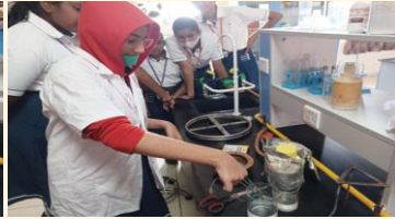
Grade 9 students Study of experiment and endothermic reaction