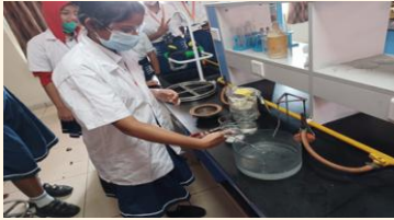
Grade 8 learners Reactions of metals with water