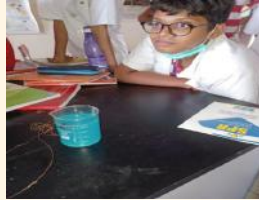
Study of the displacement reaction