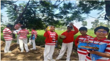
Case study on types of soil and its components - G5 Learners