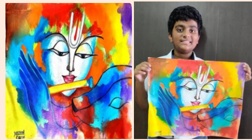
Creative Young Artist of Ambitus - Master Yajvin (5 Beta)