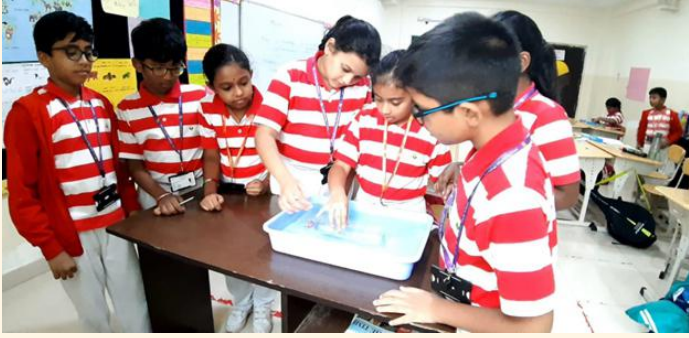
Grade 4 learners explaining properties of air